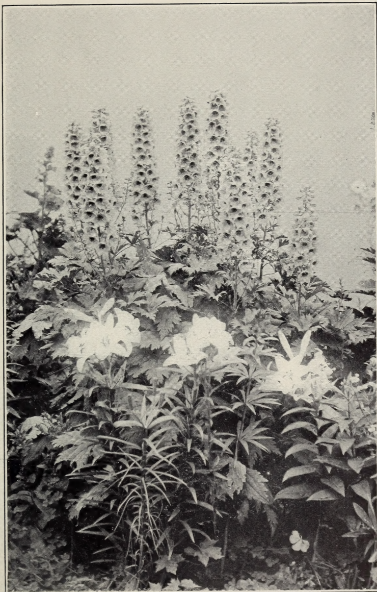
Regal Delphinium and Lilium Candidum